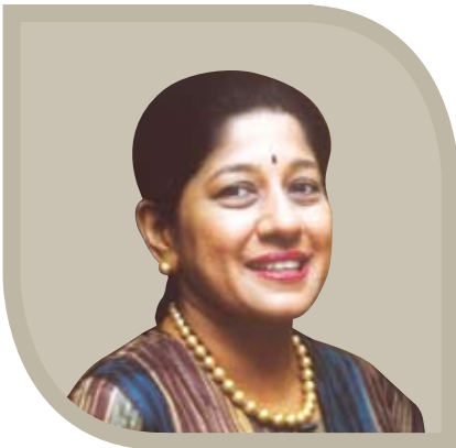
Mrs. Mallika Srinivasan